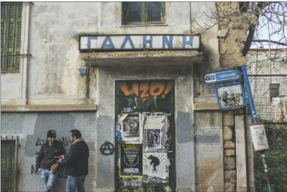
Top Image: 'Bad News', Piraeus Port Bottom Image: 'Hotel Tranquillity', city centre, Athens Containers' Terminology: Concealed Loss. When the recipient of a package is not able to see damage to the item(s) until the package is opened. The damage was not visible at the time of delivery.