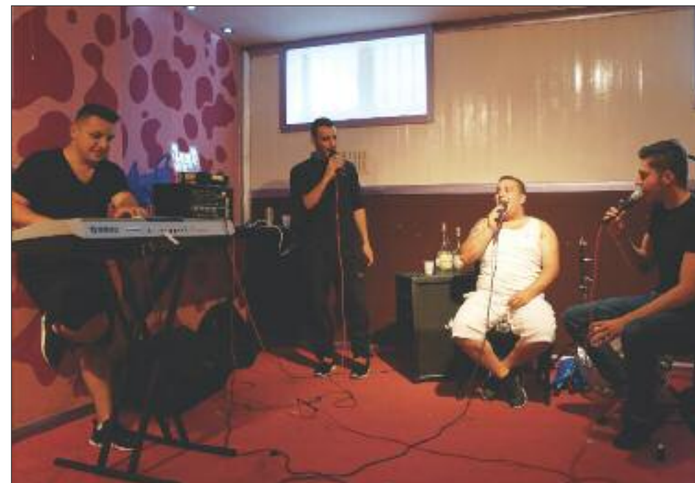
A music group of young Vlax Roma originally from Prešov in a recording studio