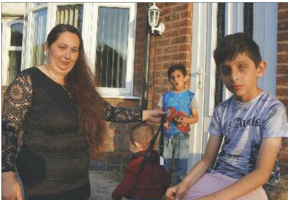
Vlax Roma family in front of the house