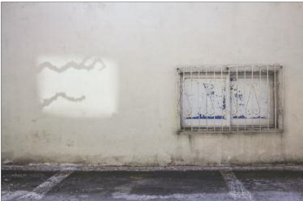
Top Image: Tag 'What exactly is a human?', city centre, Athens