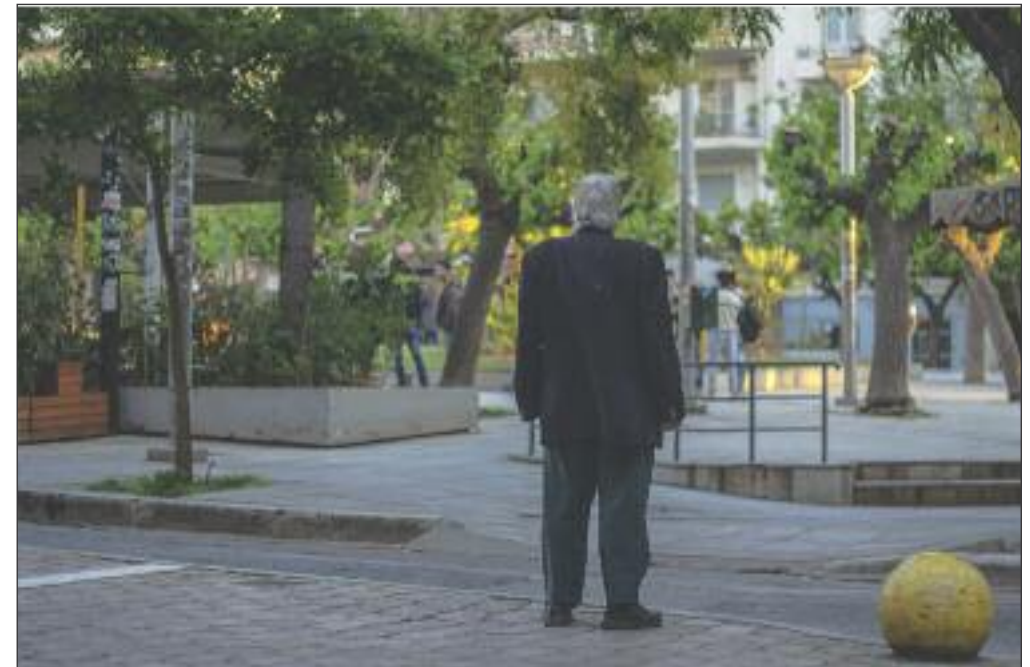
Top Image: 'Outside', Piraeus Port Bottom Image: 'Inside', Victoria Square Containers' Terminology: Intermodalism. A system whereby standard-sized cargo containers can be moved seamlessly between different 'modes' of transport, typically specially adapted ships known as container ships, barges, trucks and trains. Because the cargo does not need to be unloaded from the container every time it is moved from one mode to the other it is a very efficient and fast system of transportation.