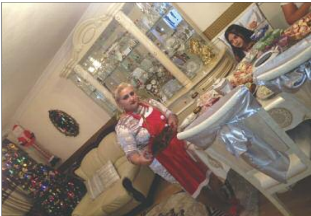
Preparation of Christmas table