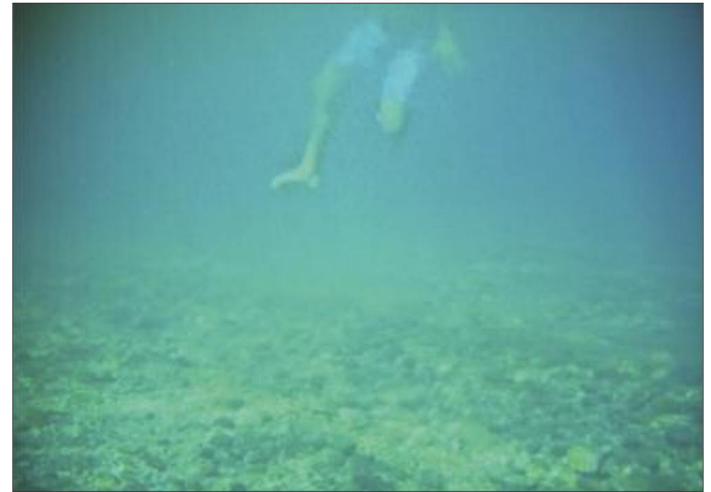
Top Image: 'Approaching', Piraeus Port