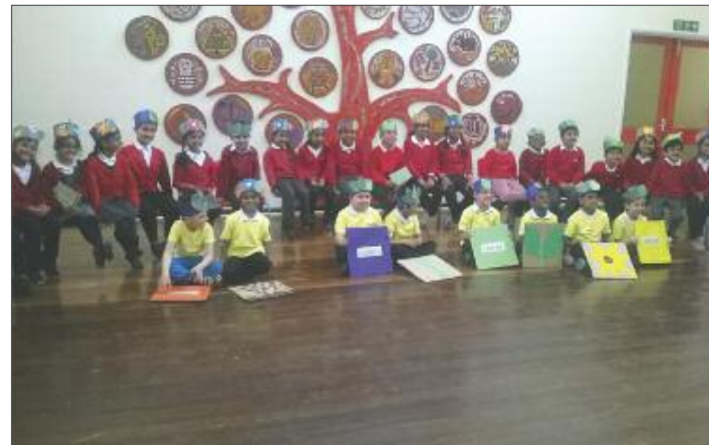
The Vlax Roma often say: "We like the life in UK, because nobody tells us we are black. Our kids are sometimes the whitest in their school classes." This school picture shows the multicultural roots of the inhabitants of the city of Leicester. (The Roma kid is in the middle of the first line, with a blue book.)