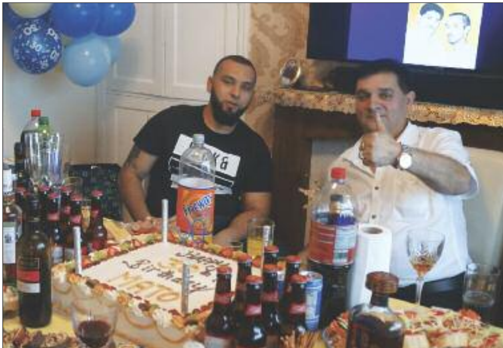
Birthday celebration. The refreshment and branded alcohol should not be missing on the table