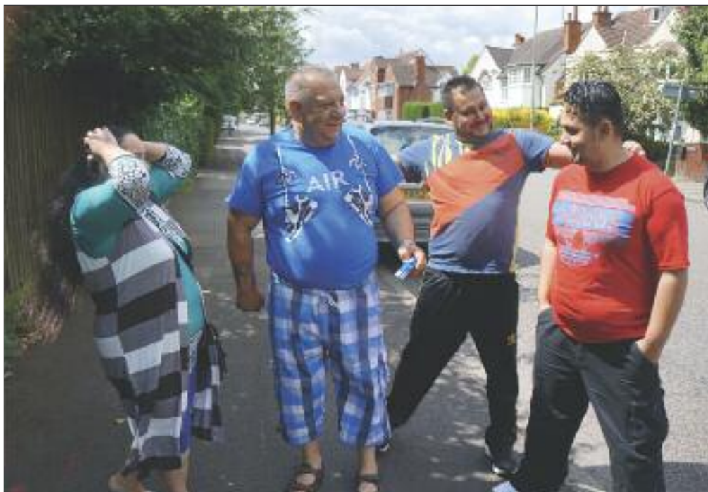
Family meeting on the street